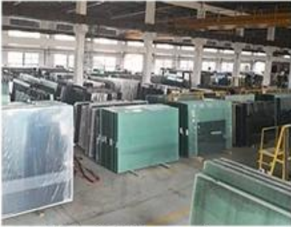
Material Storage Area