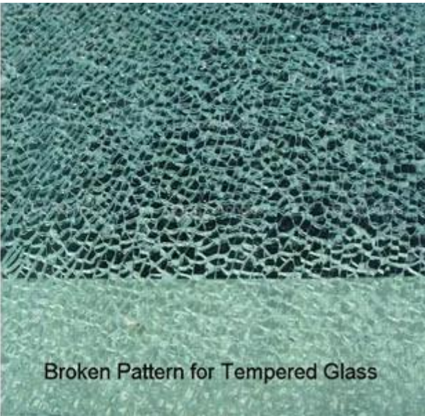
Broken Pattern for Tempered Glass