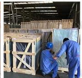
Packing & Loading