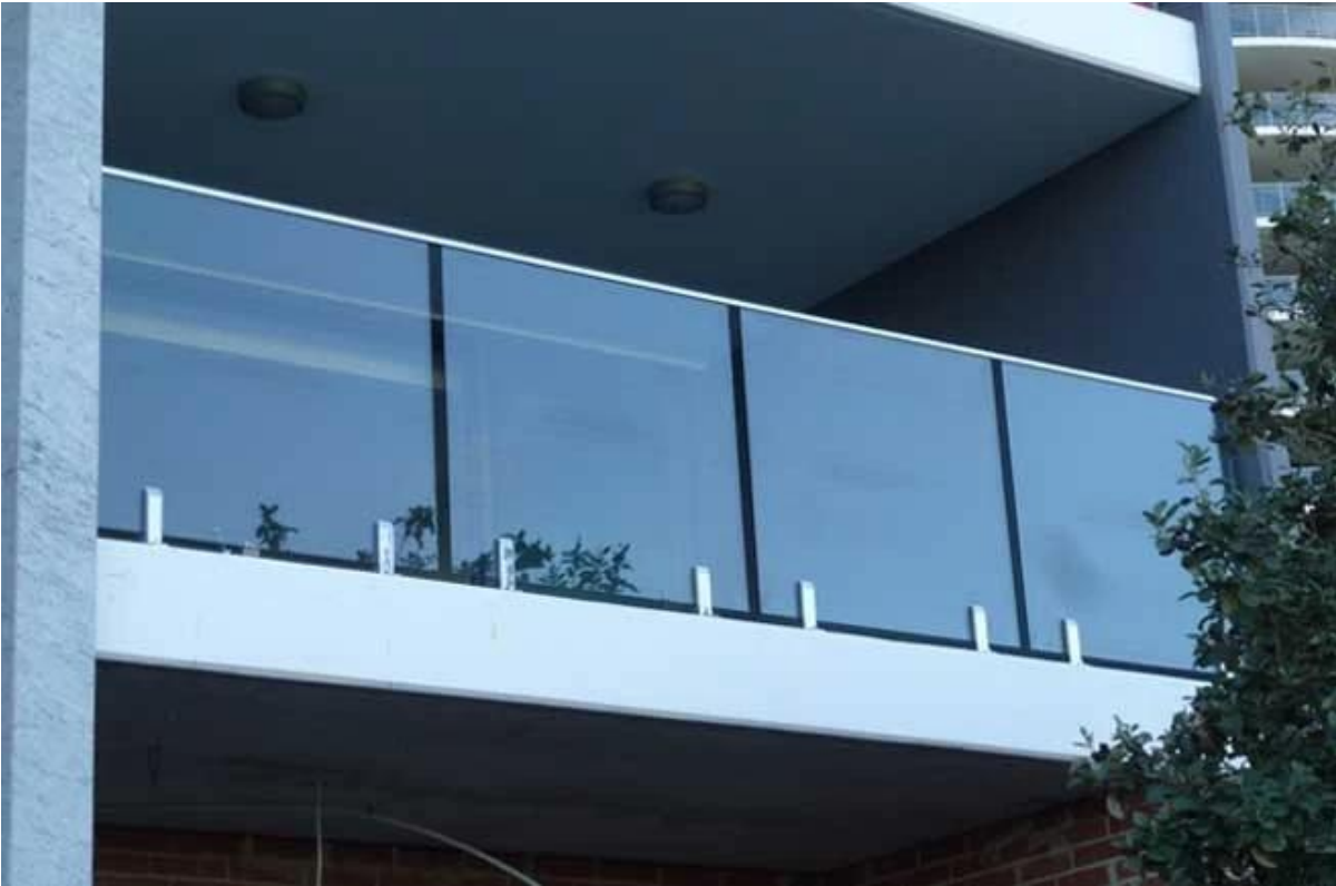
All frameless glass balustrades glass railings