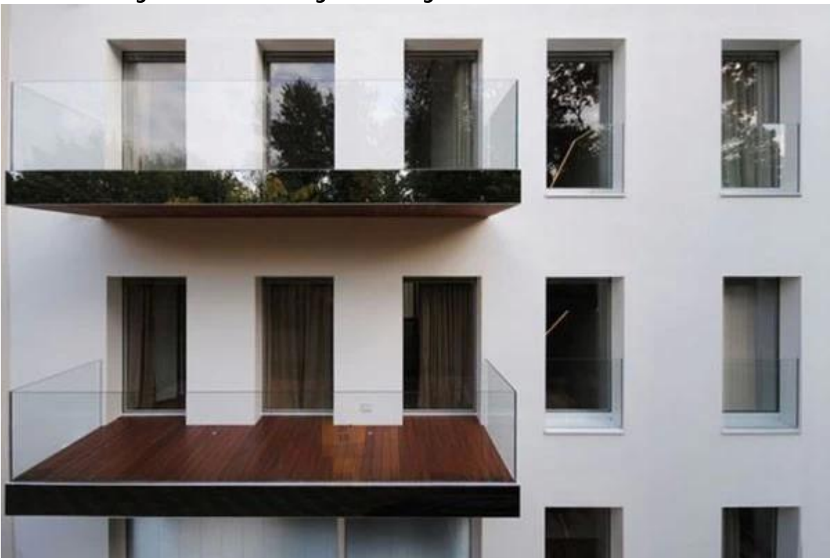
frameless glass balustrades accessories