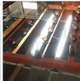
LED Lighting Detection