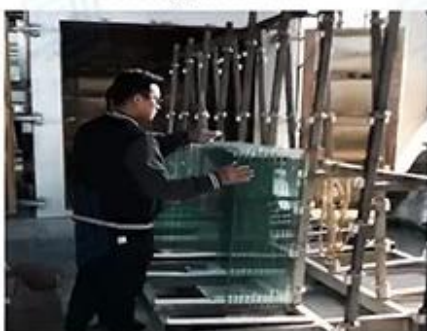
HEAT SOAK TEST