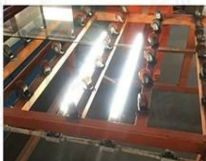
LED Lighting Detection