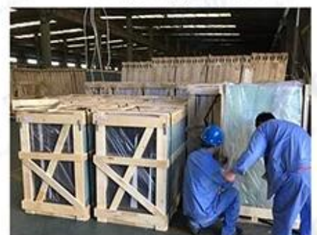
Packing & Loading