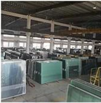
Material Storage Area