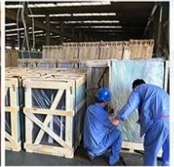
Packing & Loading