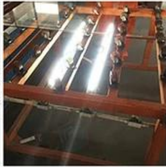
LED Lighting Detection