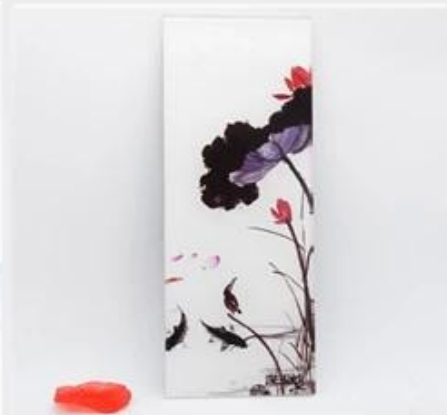
landscape painting glass