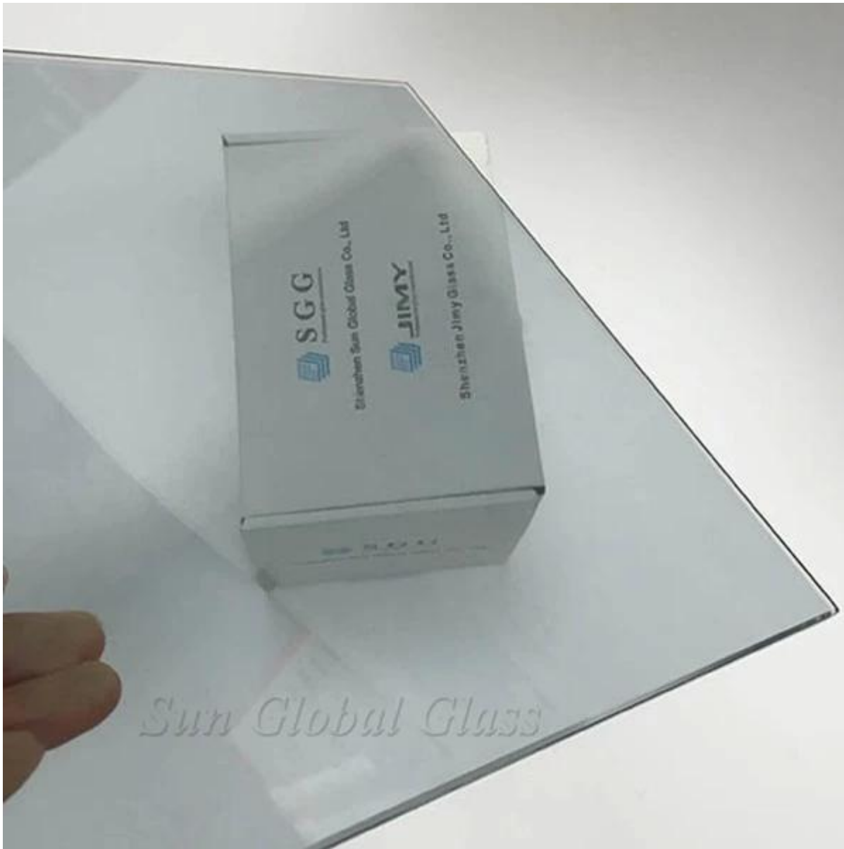
Package of Low-E glass China factory: