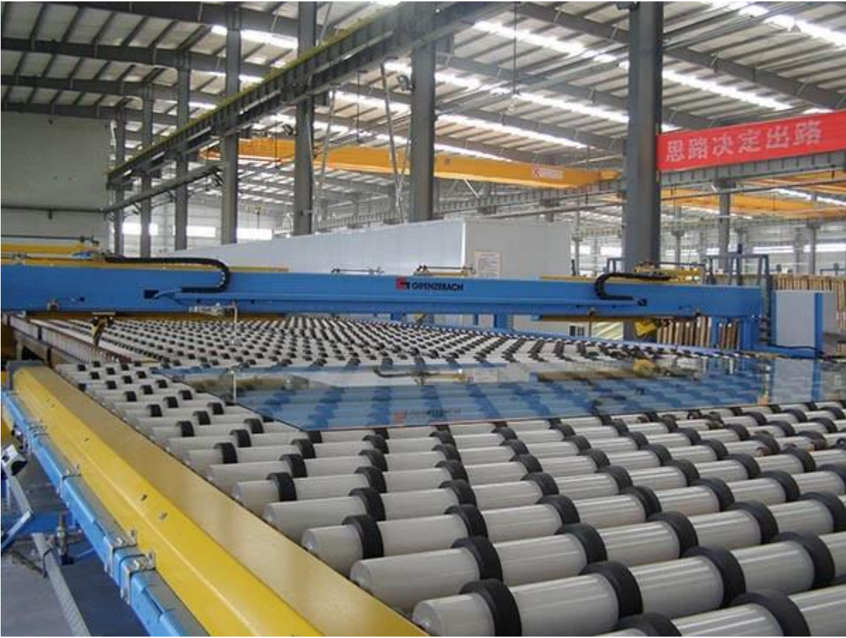
Package and Loading: