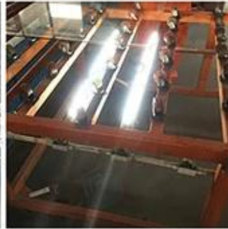
LED Lighting Detection