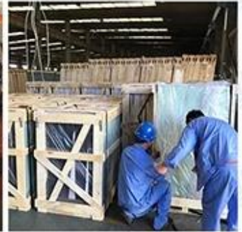
Packing & Loading