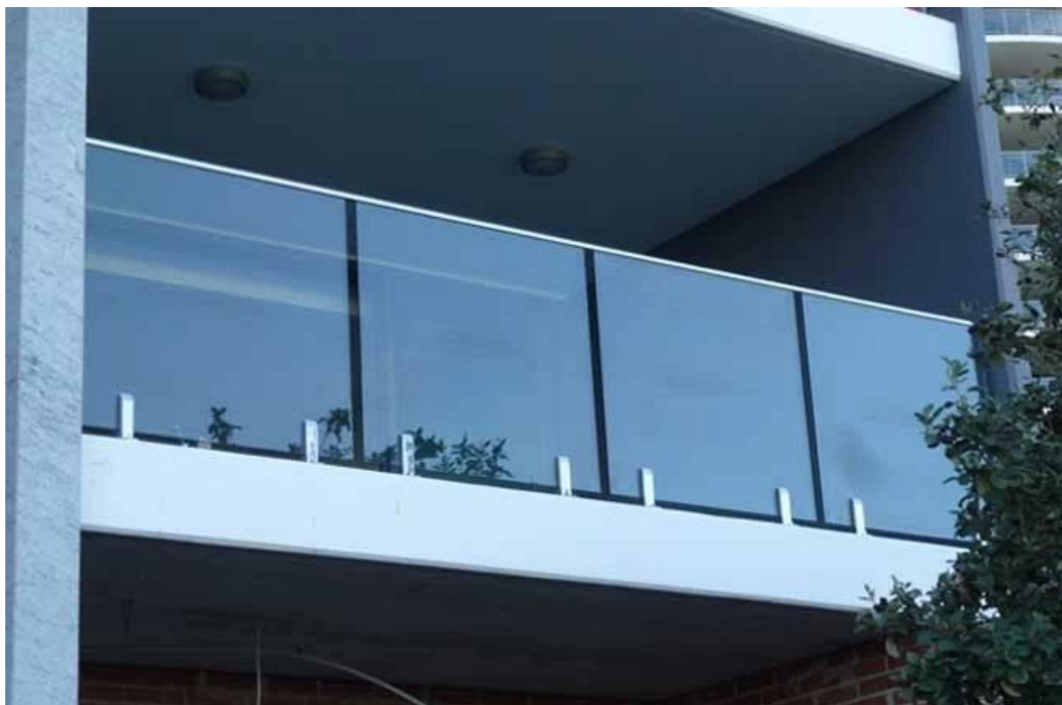
All frameless glass balustrades glass railings