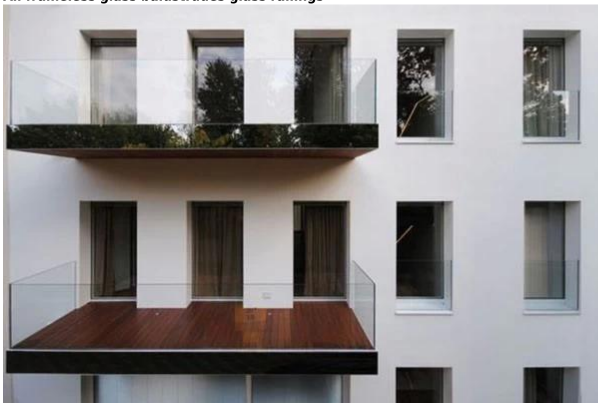
frameless glass balustrades accessories