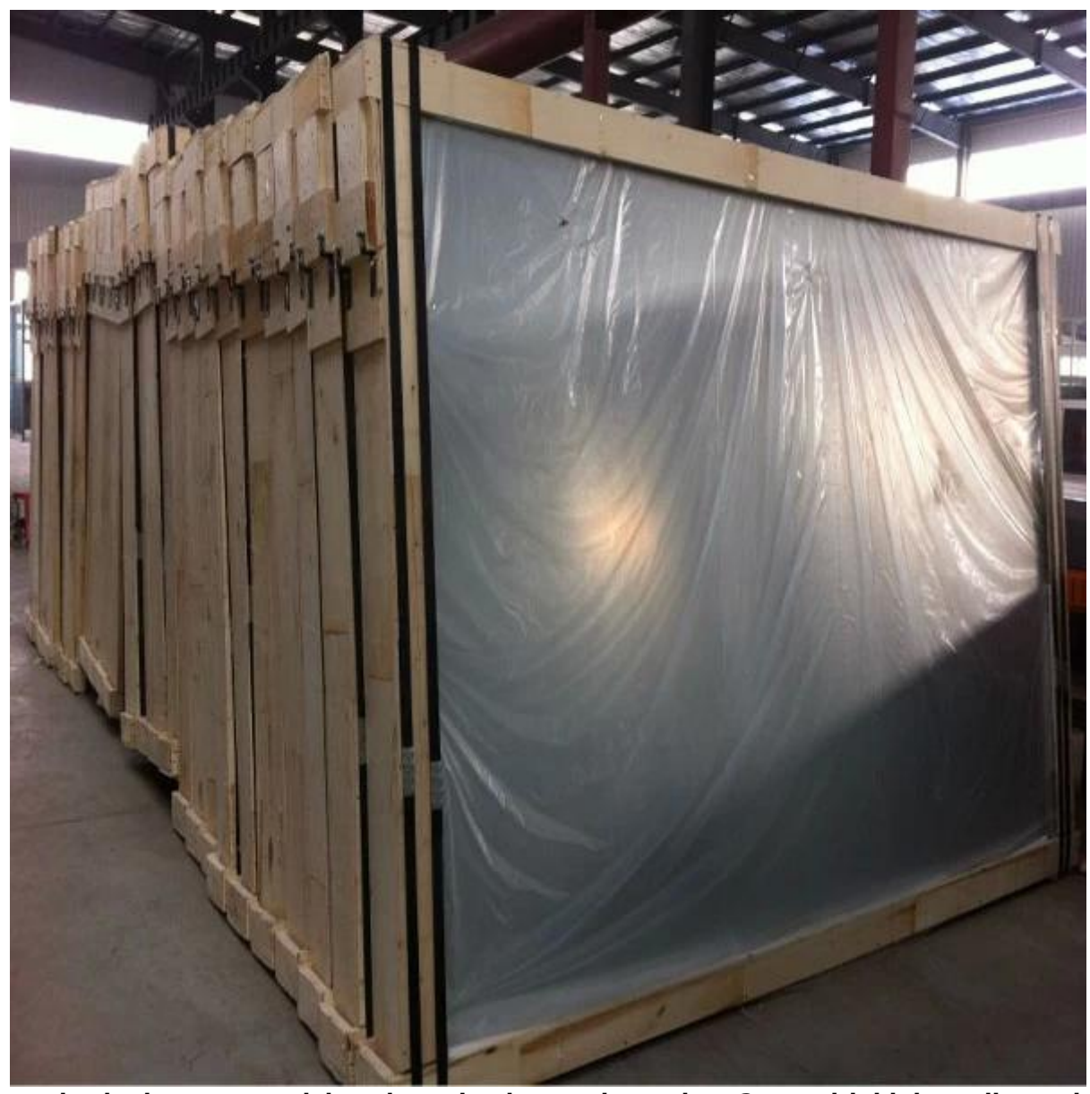
Our promise is that you receiving clear aluminum mirror glass 3mm with high quality and safety condition from us!