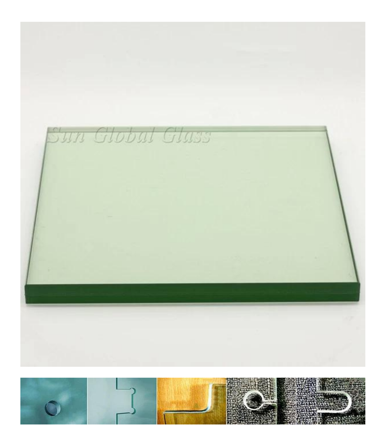
Breakage of toughened laminated glass: