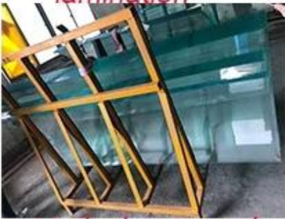
product come out