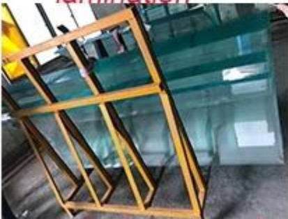
product come out