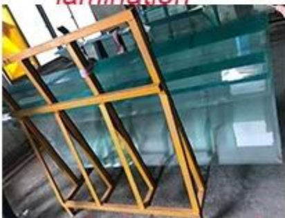
product come out