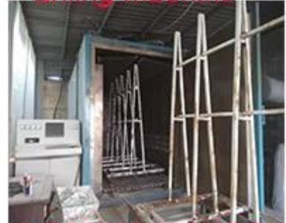
heat soak machine