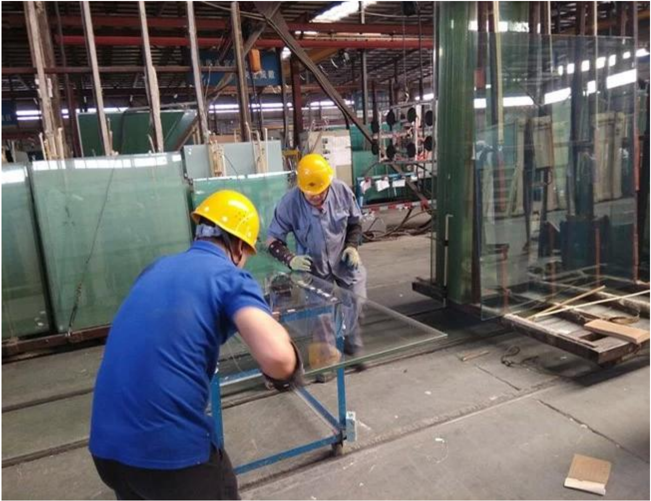
The processing of tempered laminated glass