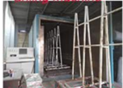
heat soak machine