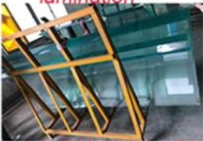
product come out