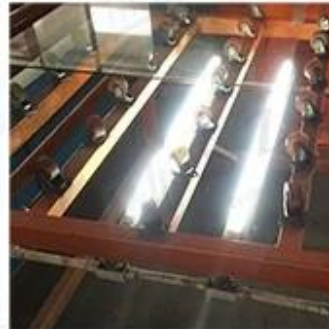
LED Lighting Detection