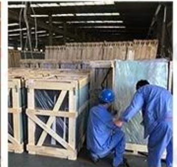
Packing & Loading