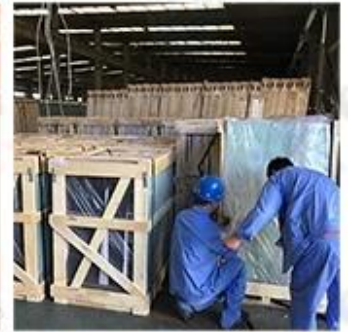
Packing & Loading