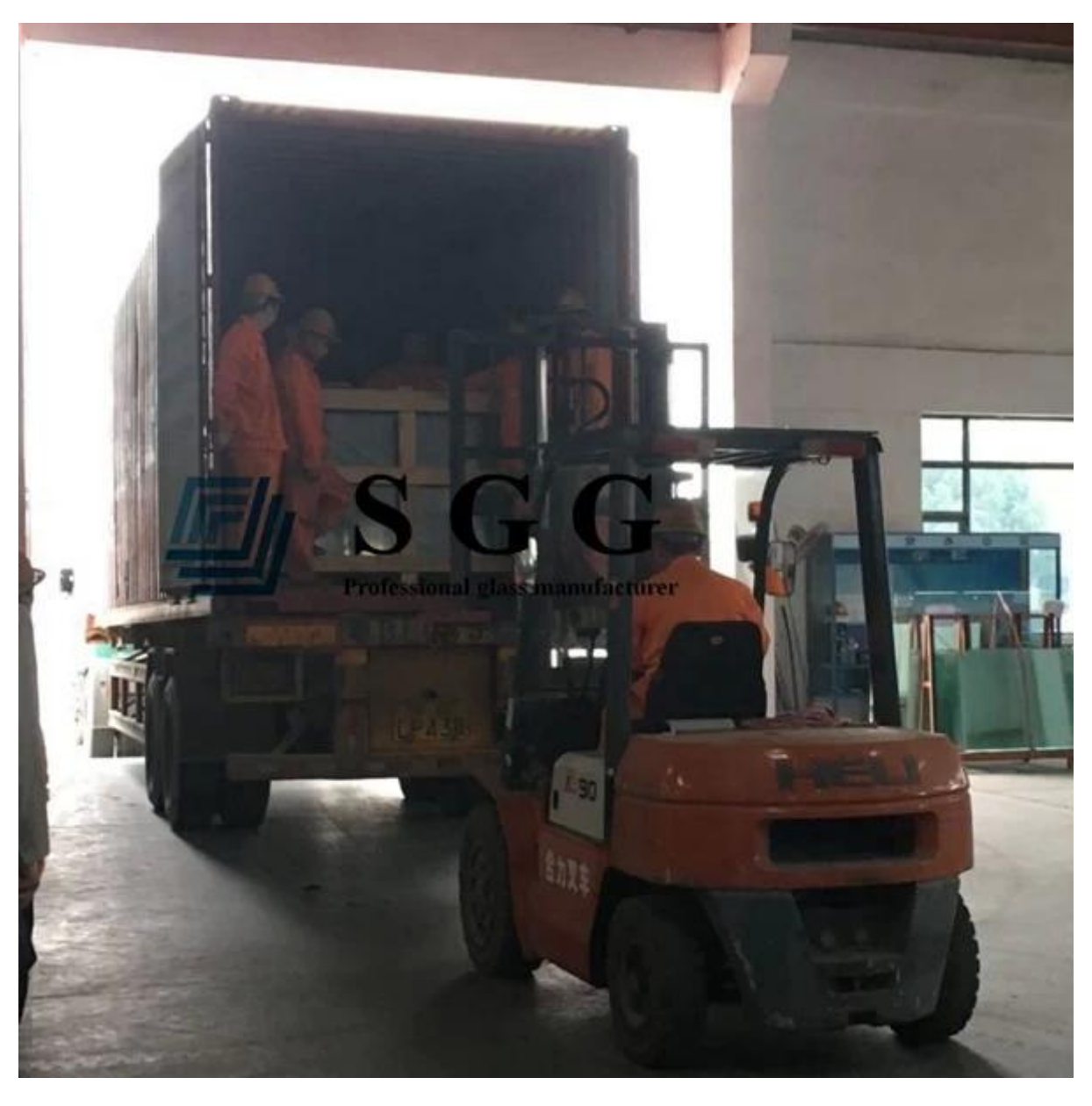
Our promise is that you receiving 6mm+15A+6mm low e insulated glass with high quality and safety condition from us.