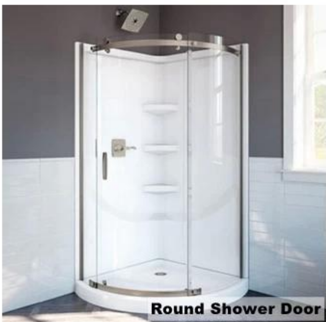
Round Shower Door