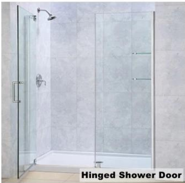
Hinged Shower Door