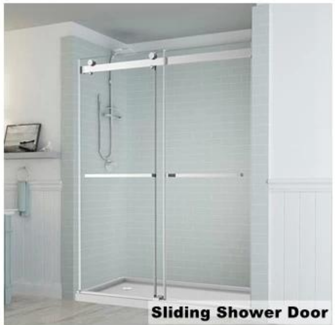
Sliding Shower Door