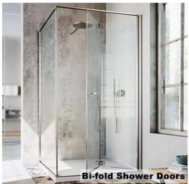
Bi-fold Shower Doors