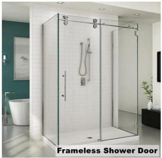
Frameless Shower Door