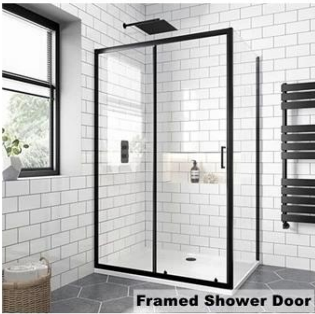
Framed Shower Door