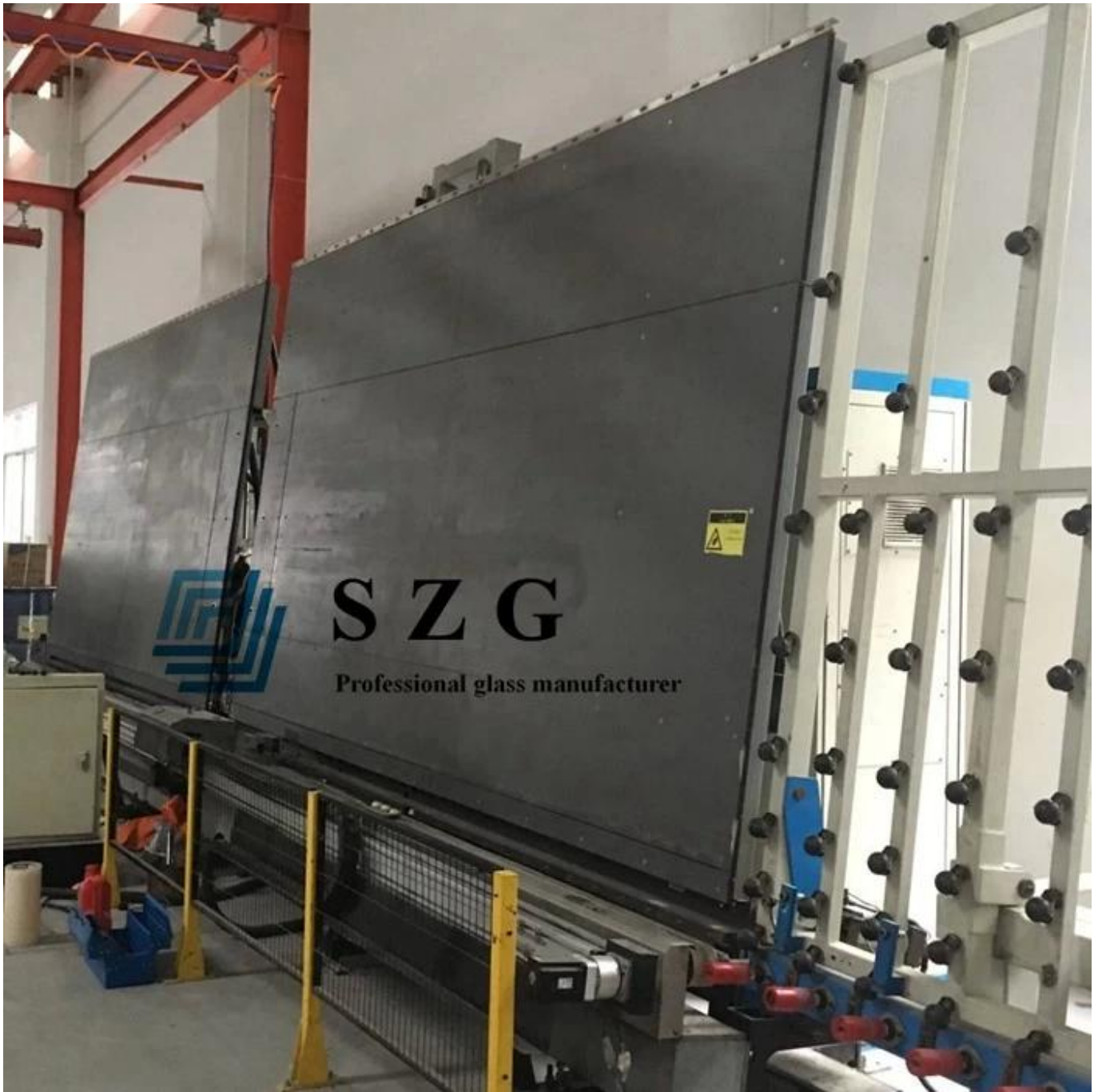
Package and Loading of facade glass: