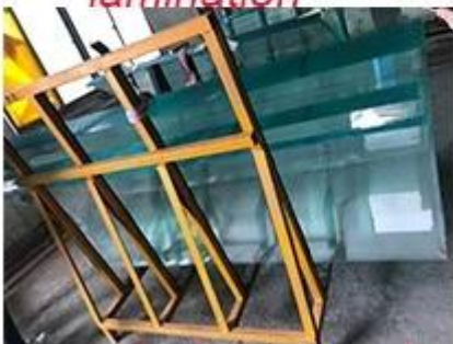
product come out