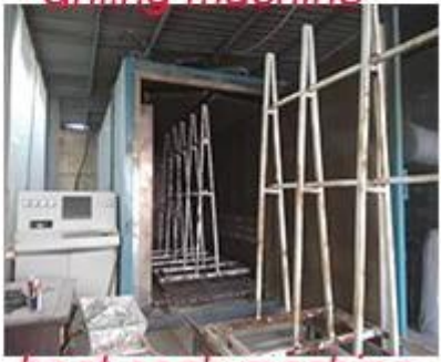
heat soak machine