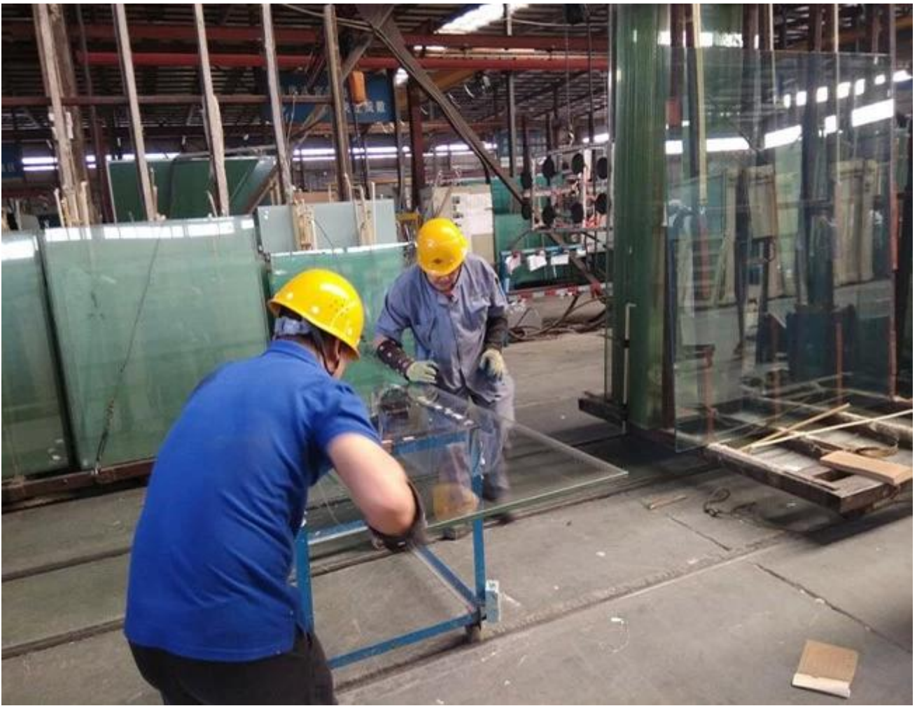
The processing of tempered laminated glass