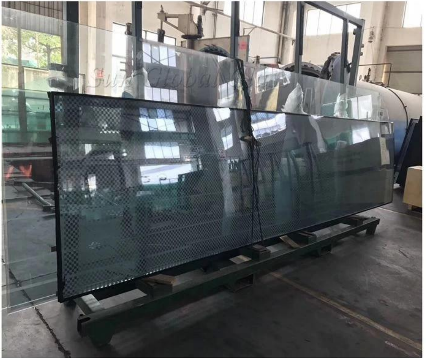
Insulated Glass Packing & Loading