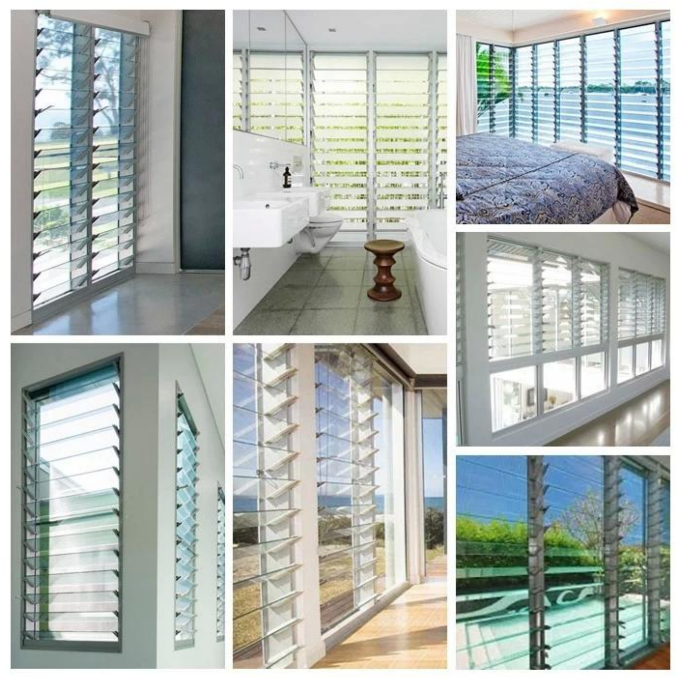
Welcome to send us inquiry with your detail requirement and question.