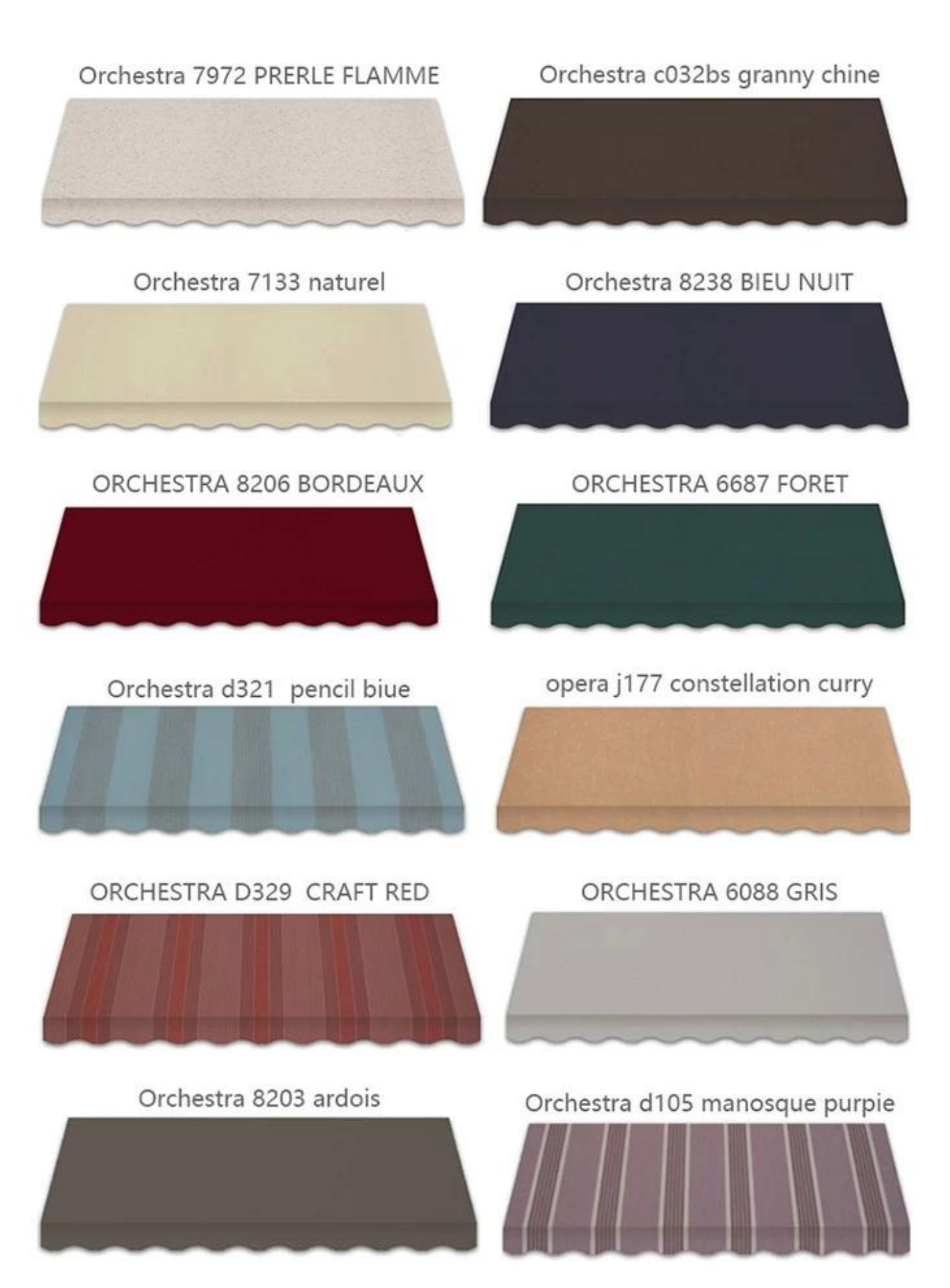
2.Sauleda, S.A. Spanish Import Acrylic optional