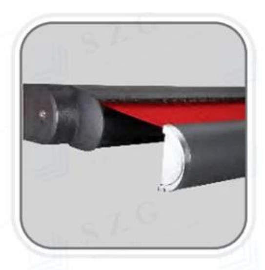
Arch front tube match the colored side cap.