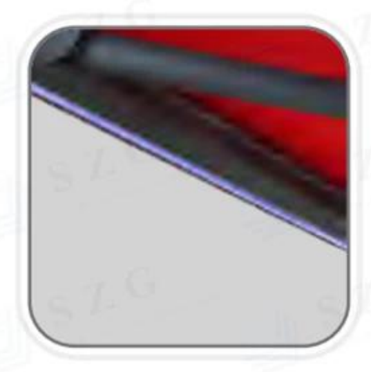
LED light is in the back of the of cassette frame, which can be operated by remote control, quite practical.