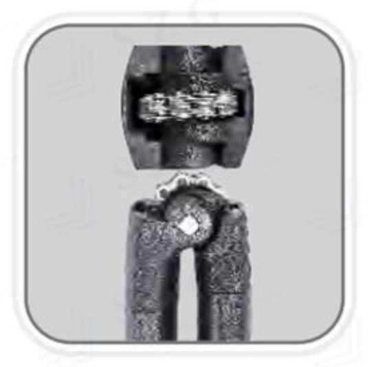
Special-shape arm increase its strength and intensity, arm is made of 304 stainless steel chain instead of steel wire, it become more durable.