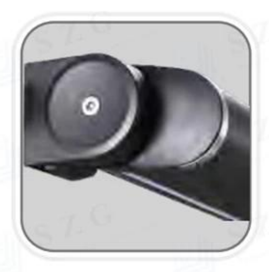
Side bracket is made of aluminum casting, it tightly combine with the wall installation brackets, looks great.