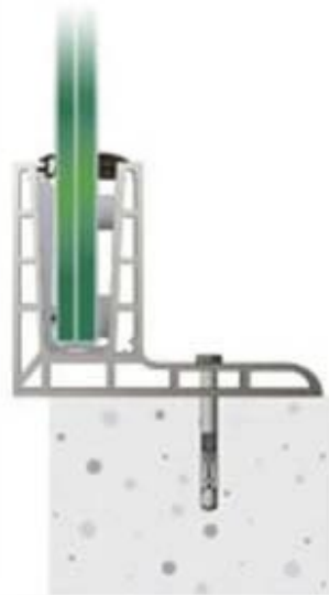
Top Mount 'F'