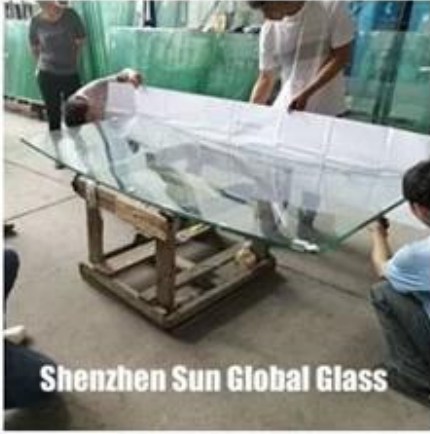
Shenzhen Sun Global Glass