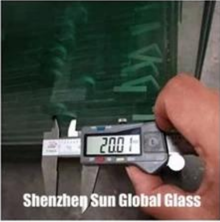
Shenzhen Sun Global Glass