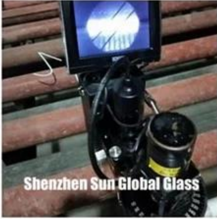
Shenzhen Sun Global Glass