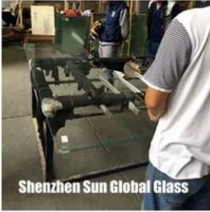
Shenzhen Sun Global Glass