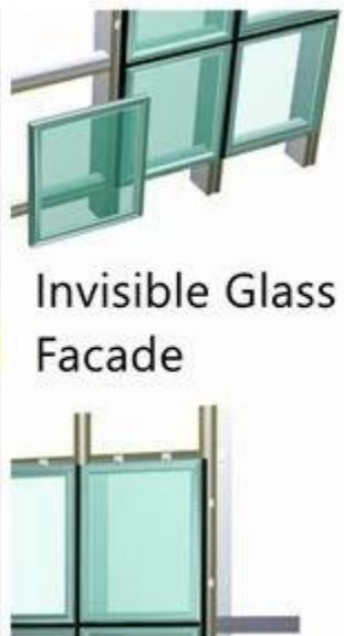
Invisible Glass Facade