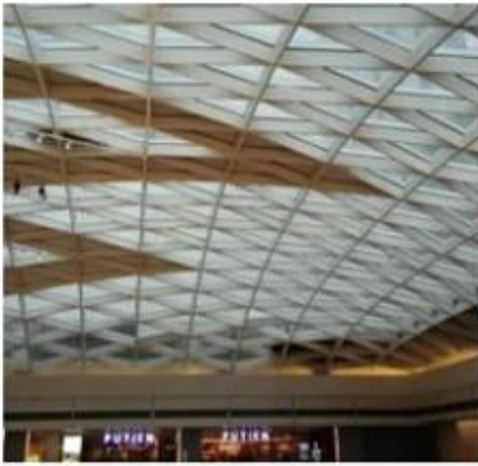
China Resources Mall Low E Insulated Glass Roofing 17.52mm High Transparent Low E laminated Glass+20A+ 17.52mm Low Iron Tempered Laminated Glass, Irregular shapes, 8000m2