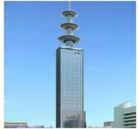
Lerato Towers 6mm clear tempered glass, 12mm clear tempered glass etc. 30000m2