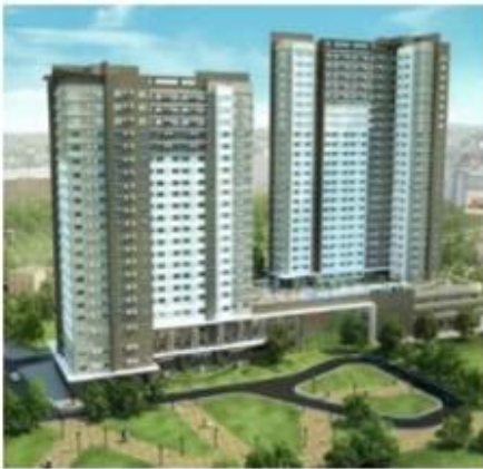
Avida Towers Altura 6mm clear tempered glass+12A+6mm euo grey tempered glass etc. 20000m2