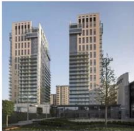
Platinum Towers 8mm crystal gray tempered glass etc. 40000m2