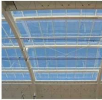
Poland-PKP Gliwice Train Station Skylight project 8+8 clear tempered laminated glass, 10000m2