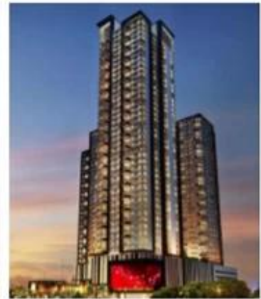
Eastfield 8+12a+8 low e Insulated glass for Eastfield project. 32000m2