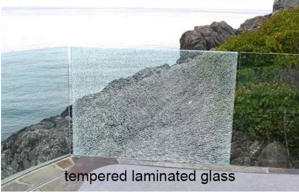
tempered laminated glass