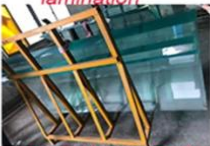
product come out