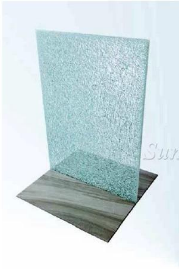
12mm Laminated Glass with SGP Interlayer