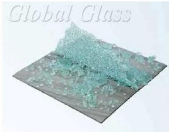
12mm Tempered Glass