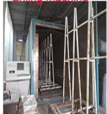
heat soak machine