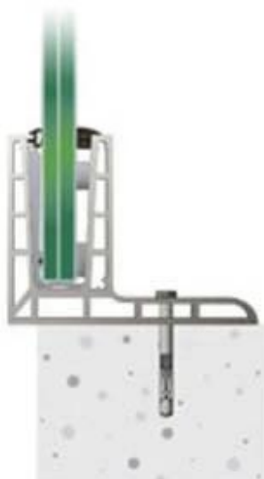
Top Mount 'F'