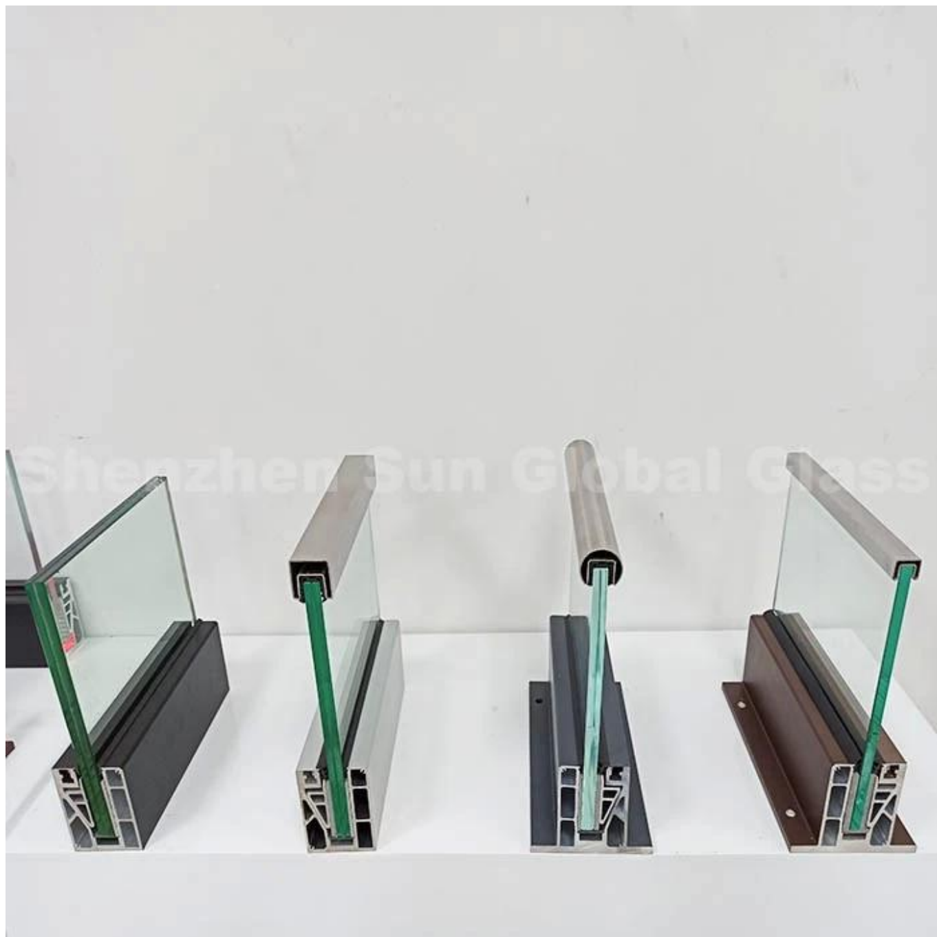
Color of Aluminium U Channel