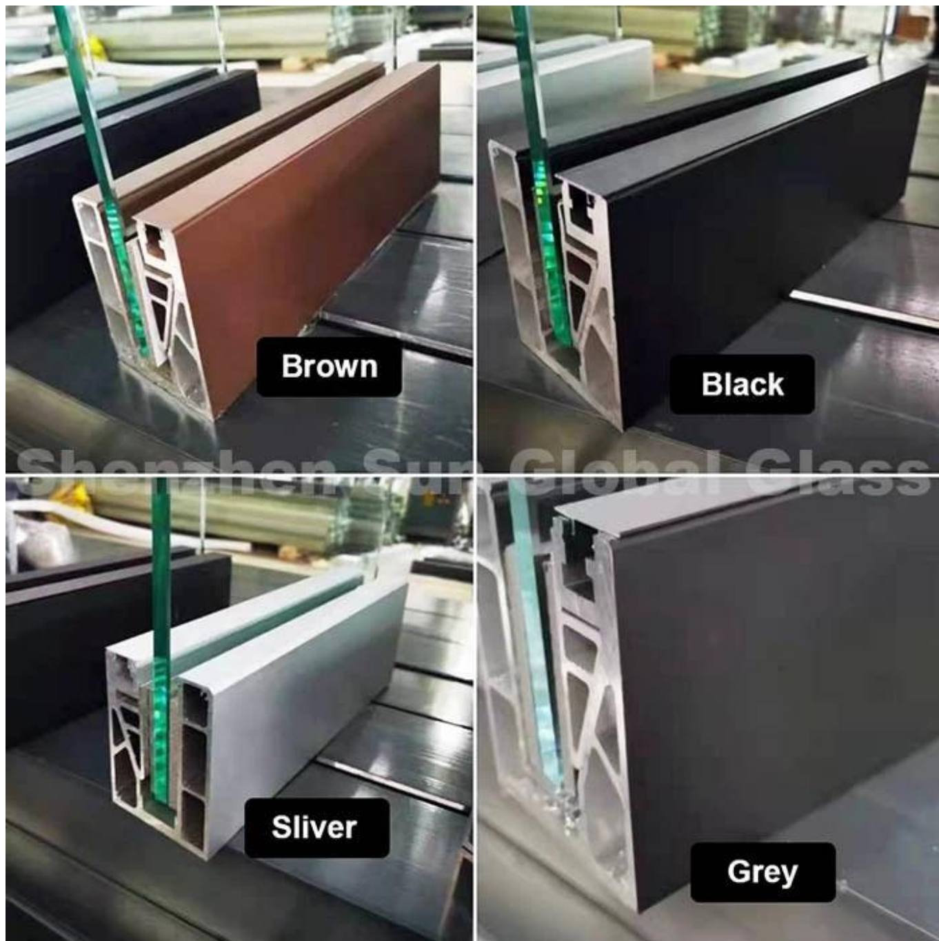
Aluminium U Channel with Led Light