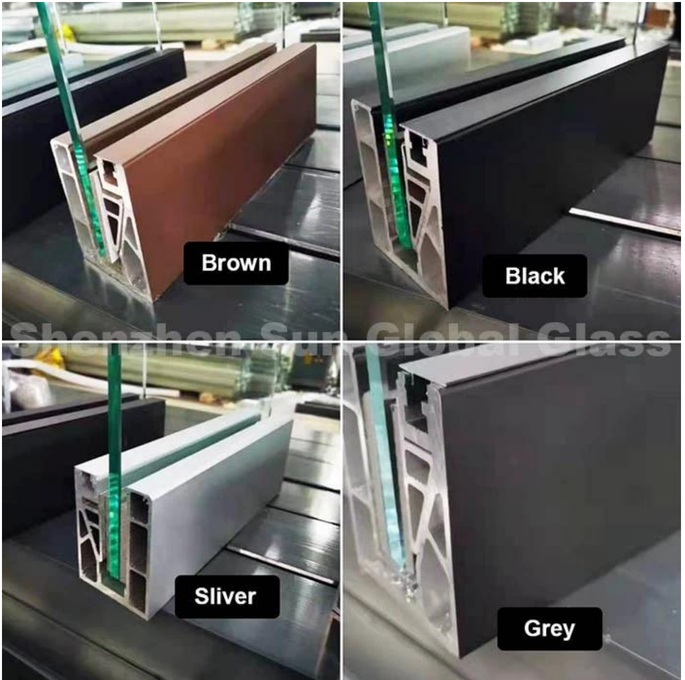
Aluminium U Channel with Led Light