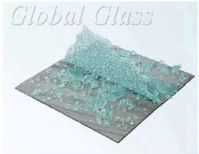
12mm Tempered Glass