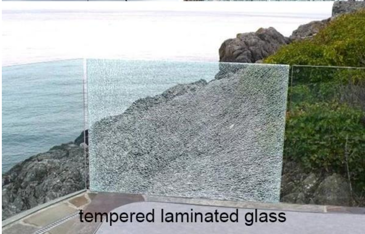
tempered laminated glass