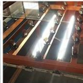
LED Lighting Detection