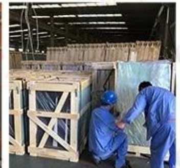
Packing & Loading