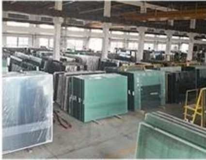
Material Storage Area