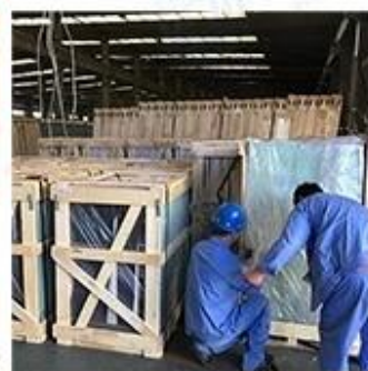
Packing & Loading