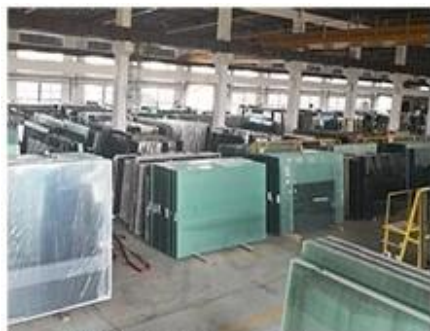
Material Storage Area