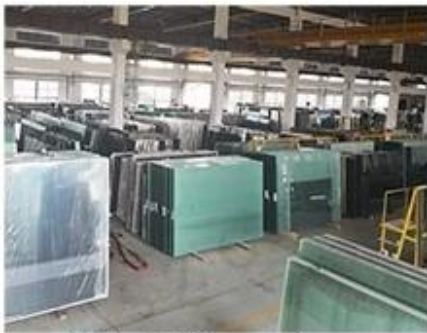
Material Storage Area