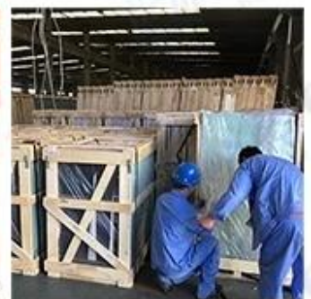
Packing & Loading