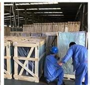
Packing & Loading