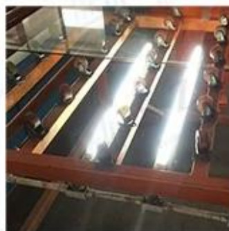
LED Lighting Detection