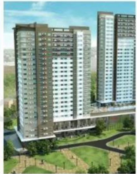
Avida Towers Altura

8+12a+8 low e insulated glass for Eastfield project. 32000m 2