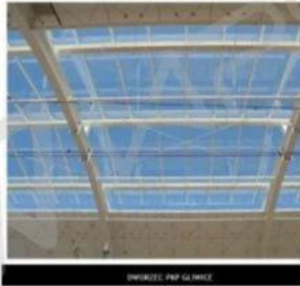
Poland-PKP Gliwice Train Station Skylight project

17.52mm High Transparent Low E laminated Glass+20A+ 17.52mm Low Iron Tempered Laminated Glass, Irregular shapes, 8000m 2