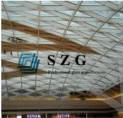
China Resources Mall Low E Insulated Glass Roofing

17.52mm High Transparent Low E laminated Glass+20A+ 17.52mm Low Iron Tempered Laminated Glass, Irregular shapes, 8000m 2