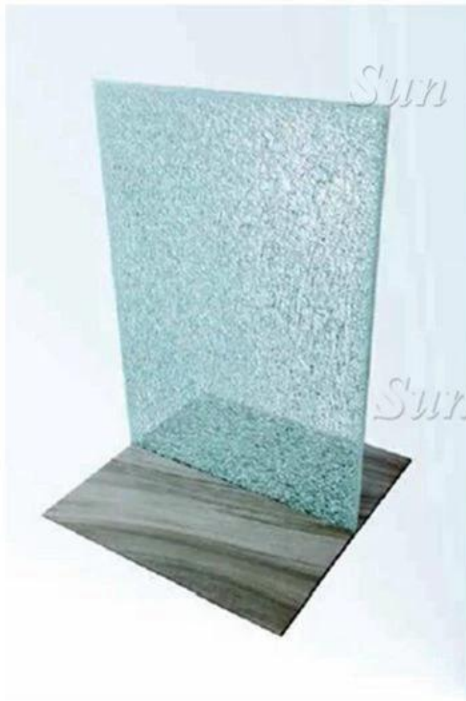
12mm Laminated Glass with SGP Interlayer