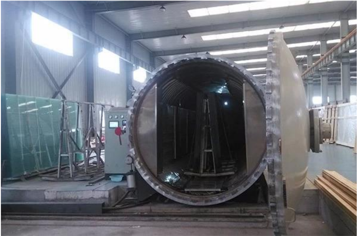
Package and Loading: