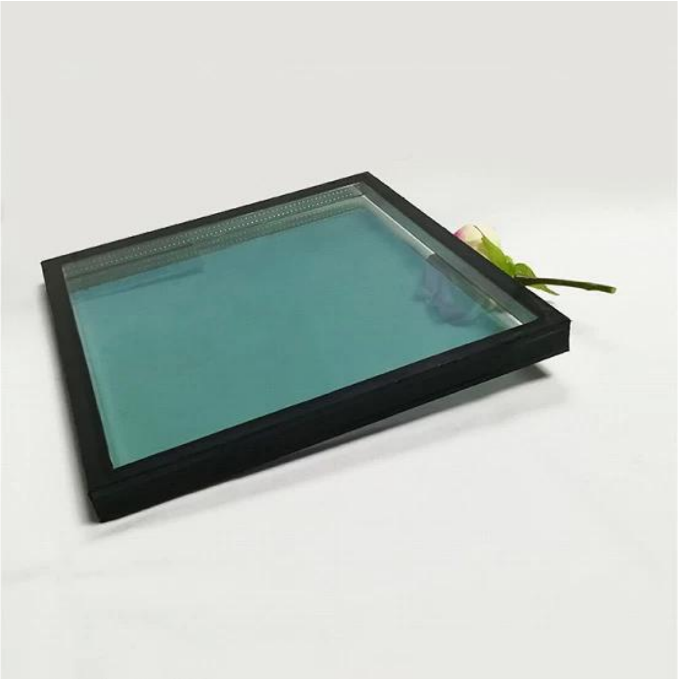
SZG Insulated Glass Details