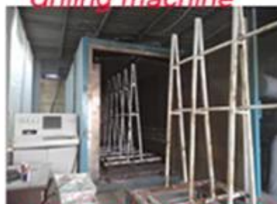
heat soak machine