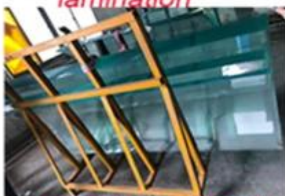
product come out