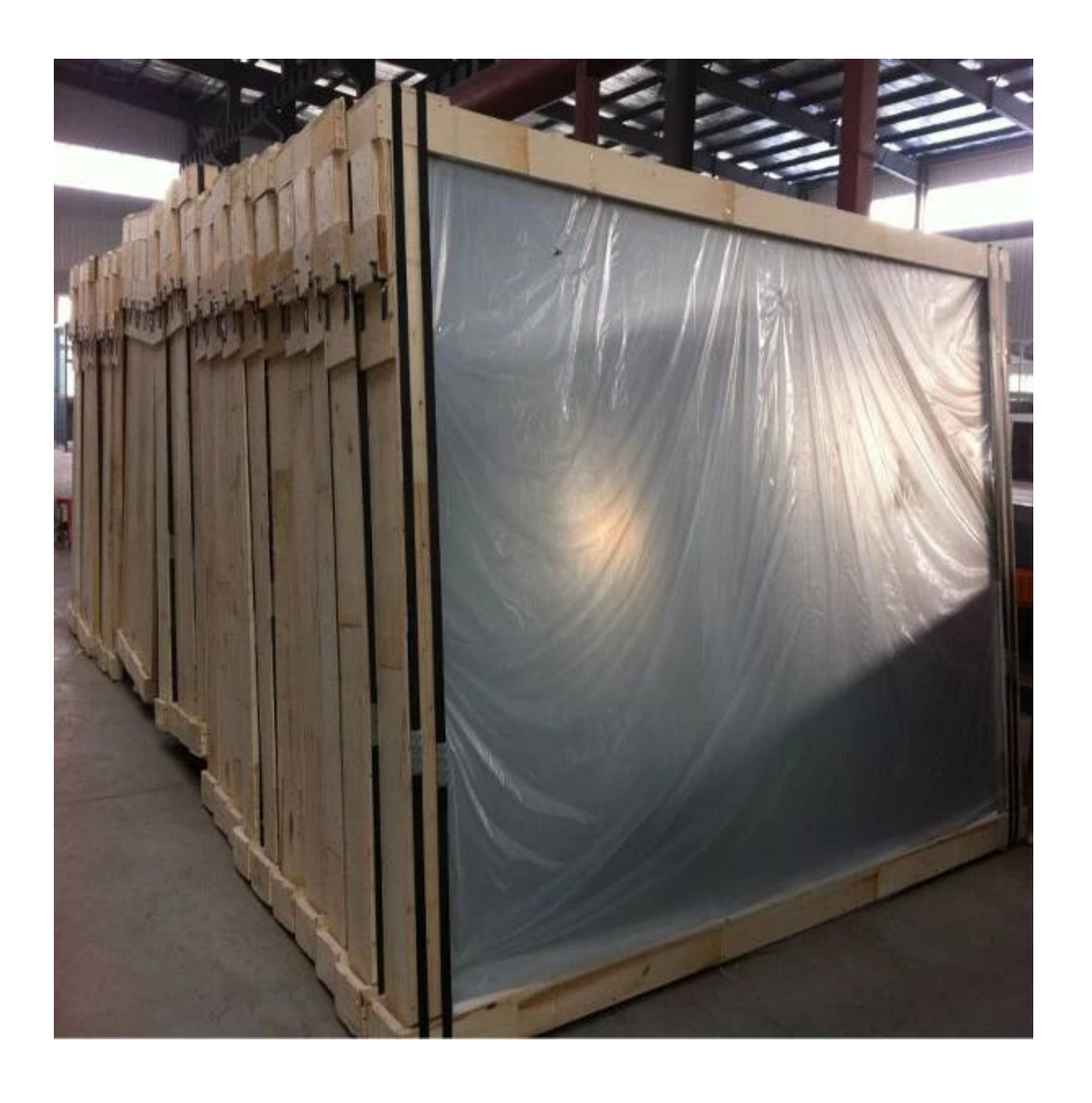
You always can have 3mm mirror and glass with high quality and high efficiency delivery time from Sun Global Glass