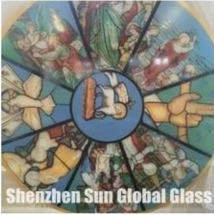
Shenzhen Sun Global Glass