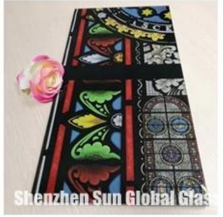
Shenzhen Sun Global Glass