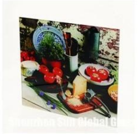
Shenzhen Sun Global Glass