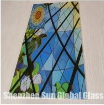
Shenzhen Sun Global Glass