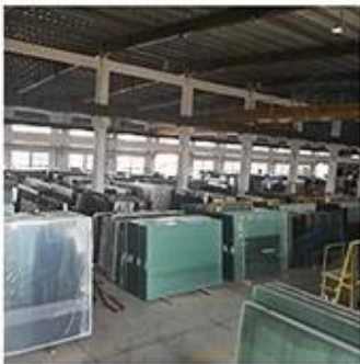
Material Storage Area