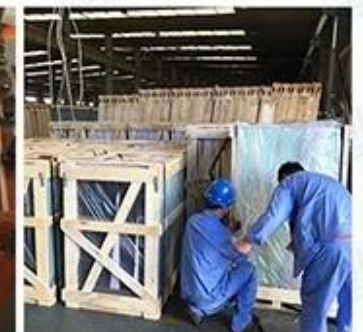
Packing & Loading