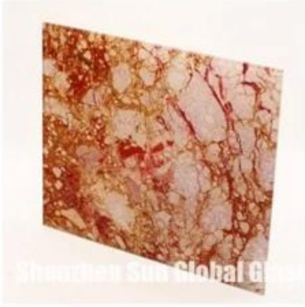
Shenzhen Sun Global Glass