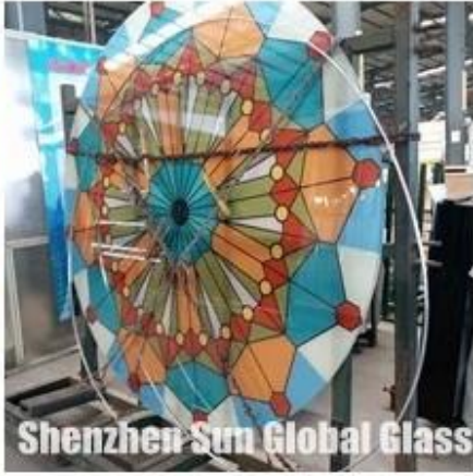
Shenzhen Sun Global Glass