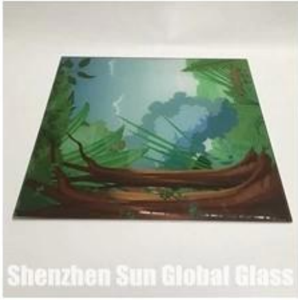
Shenzhen Sun Global Glass