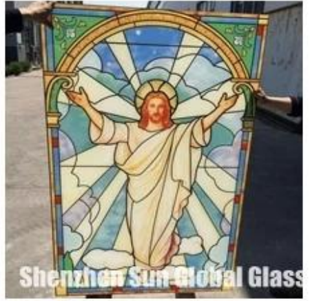
Shenzhen Sun Global Glass