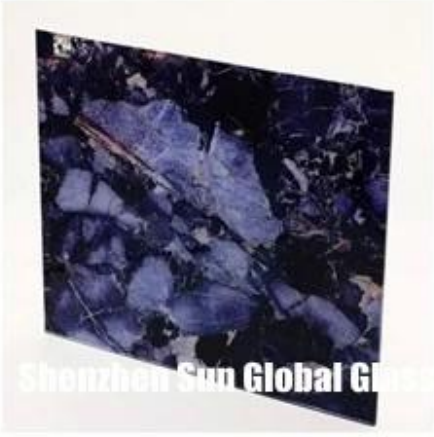
Shenzhen Sun Global Glass