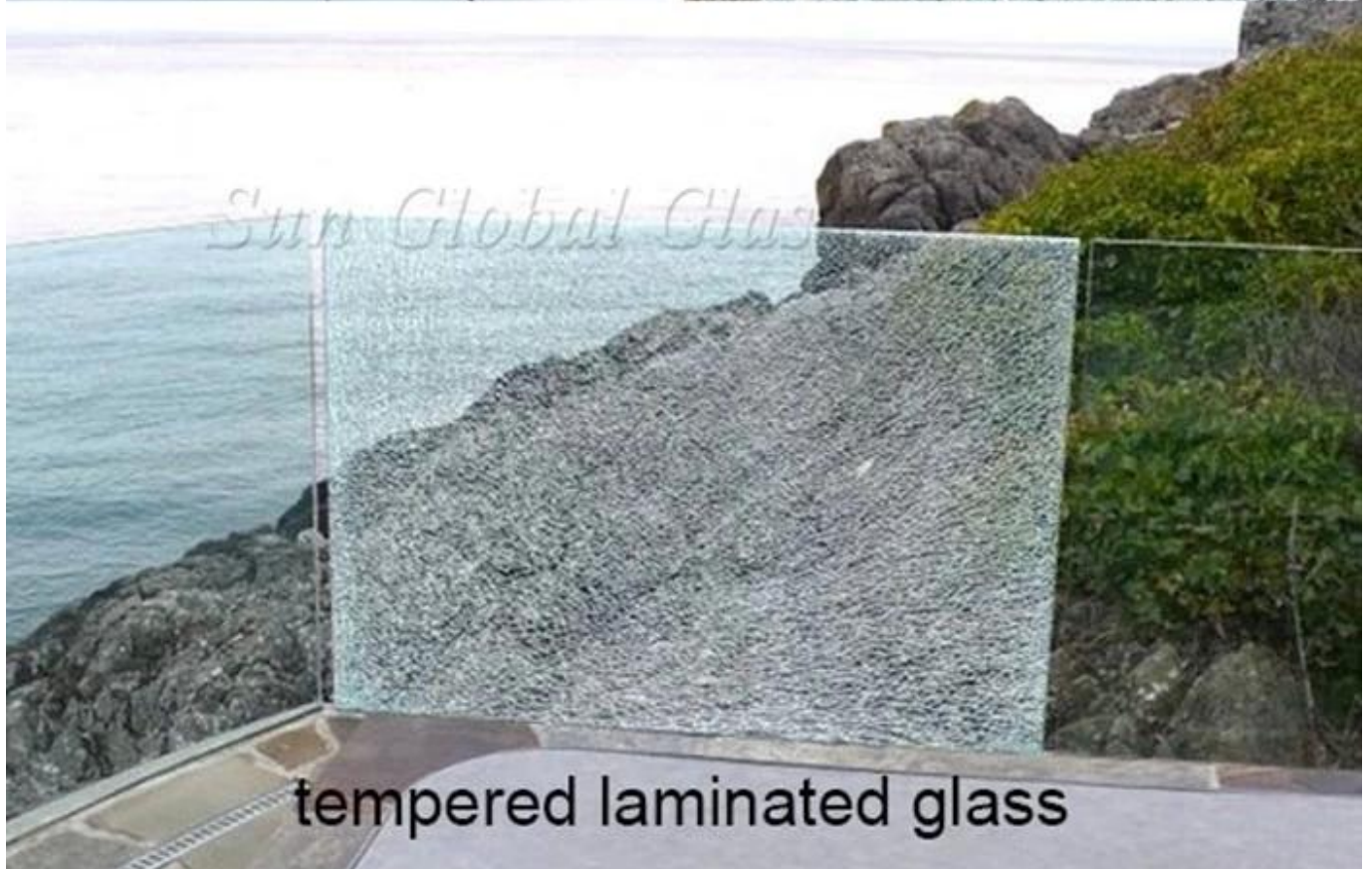
tempered laminated glass