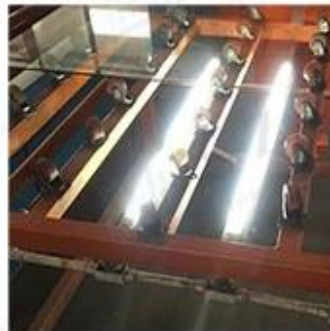
LED Lighting Detection