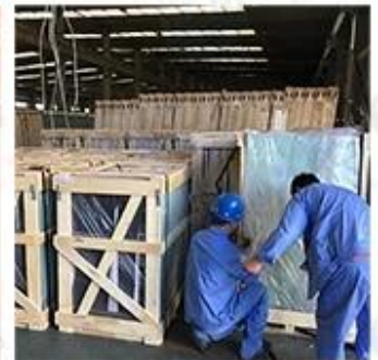
Packing & Loading